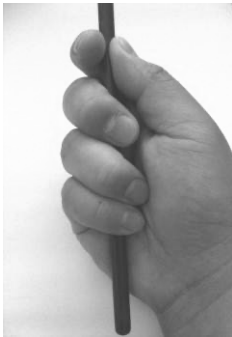
Gripping (Rear View)